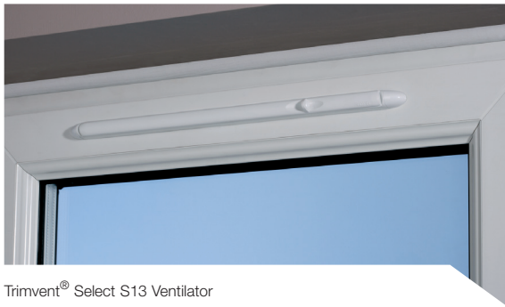
Trimvent® Select S13 Ventilator