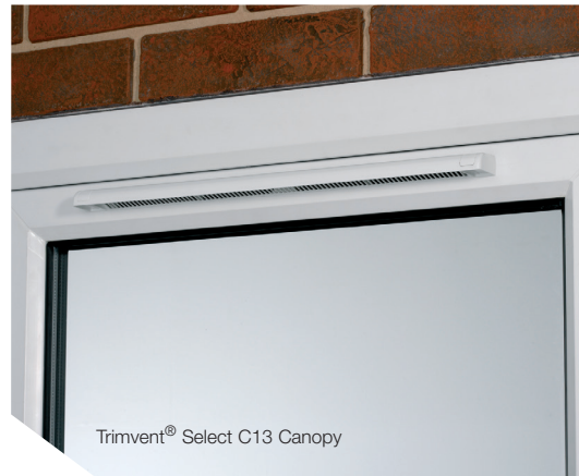
Trimvent® Select C13 Canopy

The S13 is ideal for refurbishment situations using any window material and is available in a variety of colours. Trimvent Select ventilators have been specified and fitted on millions of windows throughout the UK and mainland Europe over the last 20 years.